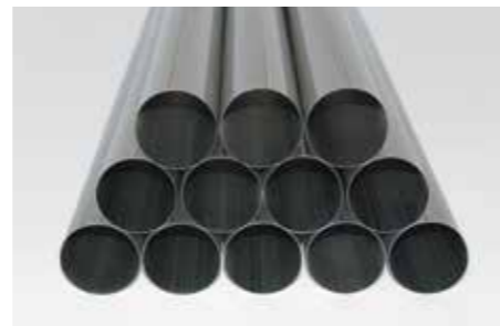
LONGITUDINALLY WELDED STAINLESS STEEL PIPES