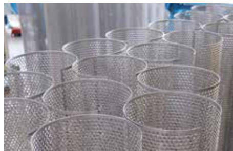
SUPPORT PIPES FOR AN EXTREMELY WIDE RANGE OF APPLICATIONS